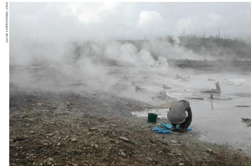
A researcher collects samples at a hydrothermal site in Yellowstone National Park.

Like many senior projects tackled by UCSC engineering students, the proposal came from an outside group that had a real-world problem in need of an engineering solution.